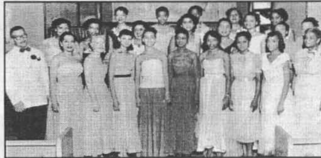
Concert Participants at C.M.E. Church